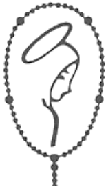
PARISH OF HOLY