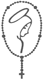
PARISH OF HOLY ROSARY