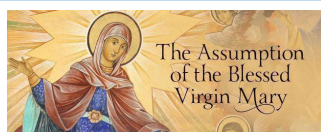
The Assumption of the Blessed Virgin Mary

This great feast is a twin to the Feast of the Ascension of the Lord. Then, if you recall, the preface of the Mass contained these words: Christ is the beginning, the head of the Church; where he has gone, we hope to follow. Today we celebrate the first of us to do just that, as we remember Mary following our Lord into heaven. She is the first to follow him - but not the last: this feast should help open our eyes to our final destination, heaven. So, this feast pushes us right back to Easter, to thoughts of death and resurrection: it is the second reading which underlines all this. It talks of the gradual resurrection of the dead: Christ first, then those who belong to him. Of these, the first is Mary, she who was without stain of original sin, she who was most blessed of all women. In her, today, we see the fulfilment of the vision of the first reading: the end of death and the victory of life in Christ.