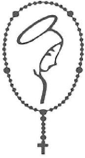
PARISH OF HOLY ROSARY