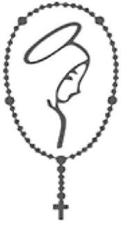
PARISH OF HOLY ROSARY