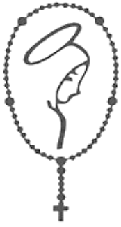
PARISH OF HOLY ROSARY