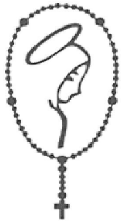
PARISH OF HOLY ROSARY