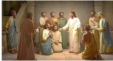
Jesus Appears to His Disciples John 20:19.31