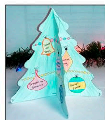
Weeks 1 & 2 together.

All of God's children are blessed with a variety of time, talents and treasures. This Advent, make a "gift to others" of your abilities, then write what you do on the ornaments on your "Share Me" tree.