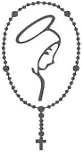
PARISH OF HOLY ROSARY