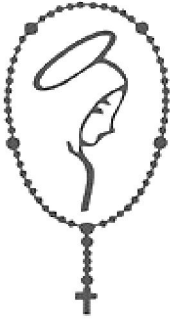
PARISH OF HOLY ROSARY

Cycle B Psalter Week 2 22nd Sunday in Ordinary Time 29th August 2021