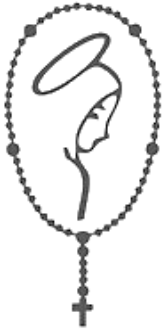
PARISH OF HOLY ROSARY