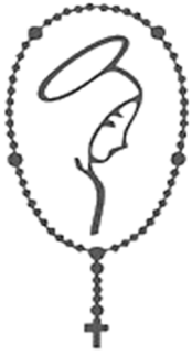
PARISH OF HOLY ROSARY

Sunday Cycle C Psalter Week 2 Seventh Sunday in Ordinary Time 20th February 2022